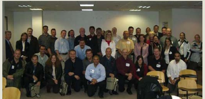
December 2006 participants of Tools for Tolerance at the MOT in L.A.