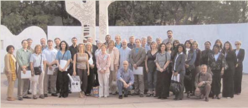
February 2007 participants of Tools for Tolerance at the MOT in L.A.