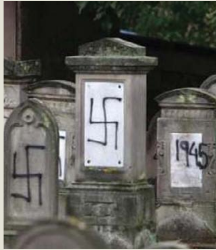
Neo-Nazi defacement of a Jewish cemetery in France term for Holocaust denial stemming from remarks he made in 1989. Ernst Zundel, the neo-Nazi who spent many years operating out of Toronto was also

European nations however, have taken the lead in combating Holocaust denial with eleven countries passing anti-denial laws. British “historian” David Irving was recently sentenced to a three-year jail