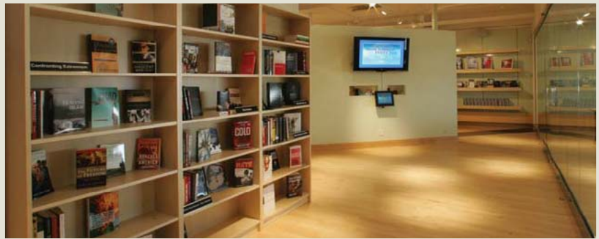
A section of the new Harry & Barbara Silverberg Reference Collection Library & Public Policy Research Centre