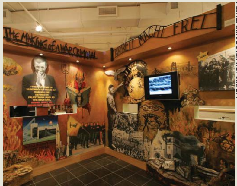
Inaugural exhibit entitled, "The Making of a War Criminal"