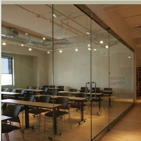
A view of the new Tom and Anna Koffler Tolerance Training Centre

To visit the Centre, use our library, attend a documentary screening or to receive the Centre schedule, please call 416.864.9735.